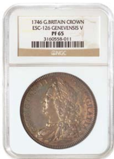
LOT 608 part of set