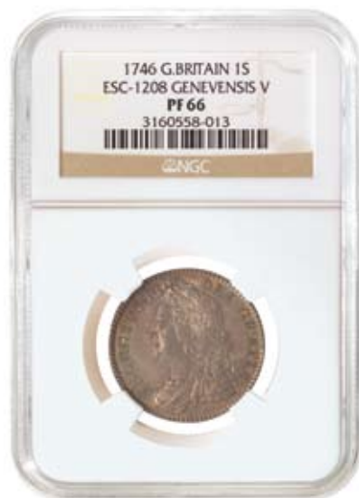
LOT 608 part of set