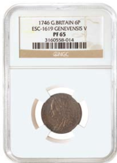
LOT 608 part of set