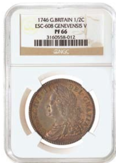
LOT 608 part of set